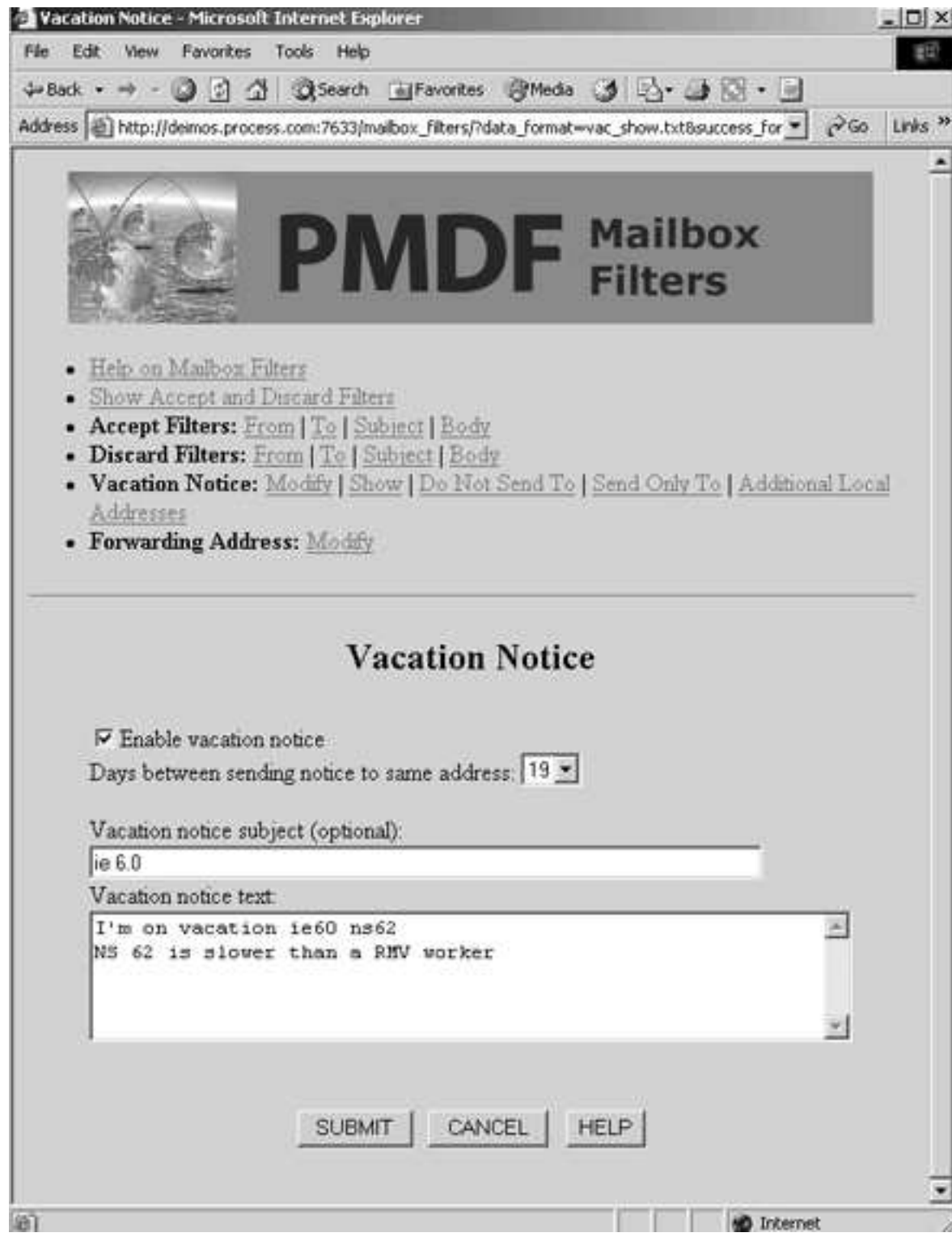
Figure 3-3 Vacation Notice