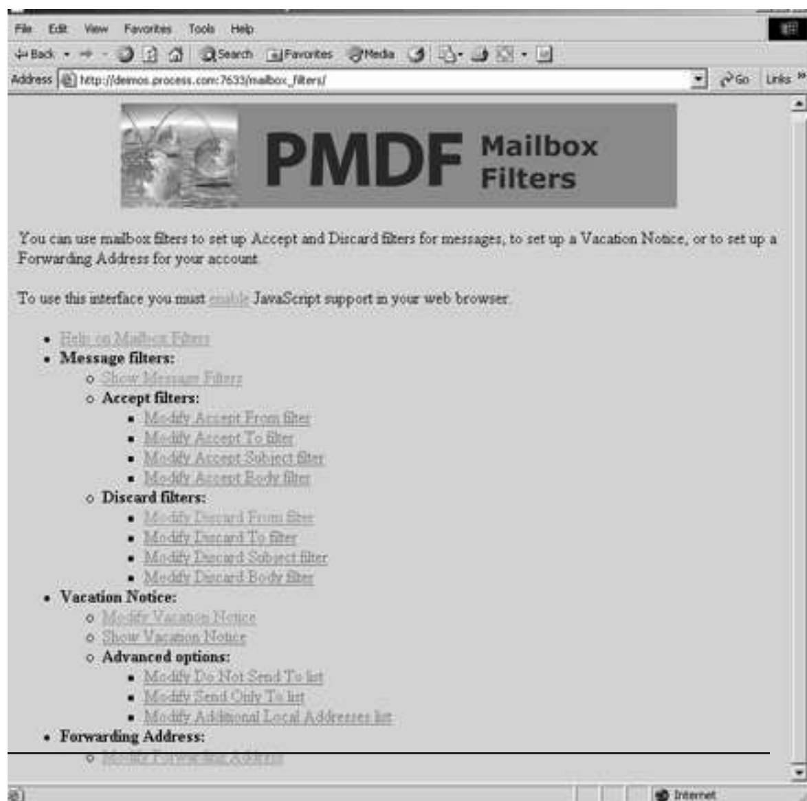
Figure 3–1 Mailbox Filter Home Page